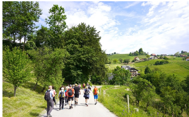
Pilgrimage in wonderful Slovenian landscape

Then the path leads us along the Buča stream through the rugged terrain of old orchards to Virštajn, where the famous Banovina guesthouse is located. Virštajn is a small settlement in the middle of the vineyards of the Virštajn wine region. The road then climbs along the southern slope between many vineyards and brick houses to the top of the ridge, from where we again have a magnificent view of the vineyards of Virštajn. As we descend, we can admire the geological composition of the soil along the road, which is first limestone and then changes to sandstone. We reach the Amon guesthouse and continue on the road next to the golf course. When we reach the main road after a few turns, we can already have a nice view of Olimje - a village with an old monastery, which we reach after a few minutes walk along the meadows.