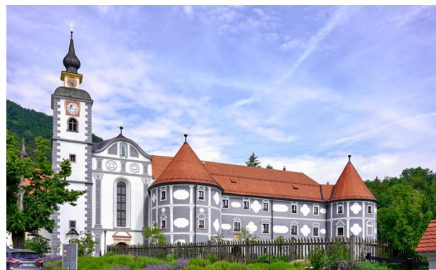
Impressive Monastery Olimje

From the Olimje monastery, next to the beautiful herb garden and beehive, we descend on the footpath along the road planted with trees to the spa Podčetrtek. On the left side, on a nearby hill, we can admire the Church of the Holy Virgins on the sand. In Podčetrtek, the path leads us through the compact village center, past the parish church of St. Lovrenca to the ridge above the village, from where we can already see the old castle, which is being renovated. Passing the former outbuildings of the castle, we slowly descend to the neighboring valley. Further along the path, under a shady walnut tree, we find a drinking water spring that invites every hiker to quench his thirst and rest on hot summer days. Soon the view opens up to the valley ahead and the church of St. Emma on the neighboring hill. We descend into the valley, cross the main road and the railroad line and climb up a very steep path to the ridge until we reach the road that leads us to the church of St. Emma.